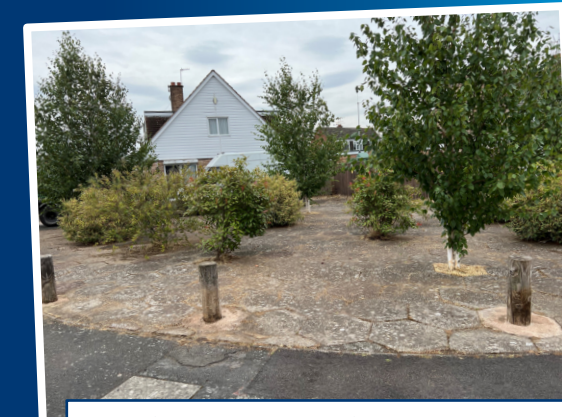
Beechfield Drive, tidy, after the works were carried out for residents.