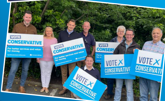
Together we can and will bring pride back to our community. Focusing on what is important to you.