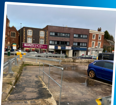
The Conservatives successfully negotiated and agreed the demolition of Crown House by the owners at no cost to the tax payer.

We support the economic regeneration of Kidderminster town centre. The Conservative Government allocated WFDC back in 2020 £20 million from the Future High Streets Fund which was an application submitted back in early 2019 by the then Conservative-led WFDC. We feel that the Labour/Green/Independentled Council has not delivered on this project quickly enough and that it is essential that the redundant brownfield sites in the town centre are redeveloped.