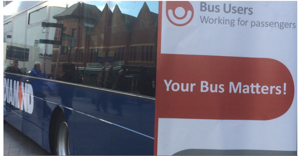
An emergency task force is being formed to ensure the County's Bus network. Residents views will be sought to ensure that it meets residents needs

Local Councillors will also be invited to the Task Force and residents are being encouraged to have their say by contacting their local councillors or by using passenger forums, who will be represented at the meetings.