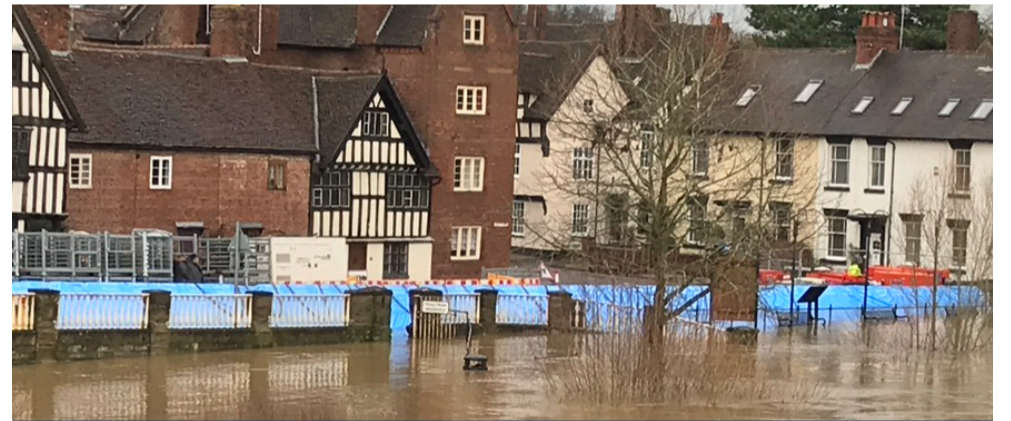
Funding is secured and the plans are being compiled for submission to planning. Protecting homes and businesses from the River Severn.

The plans are being worked up and should be completed by early 2024. After years of suffering, the town will finally be properly defended from flooding.