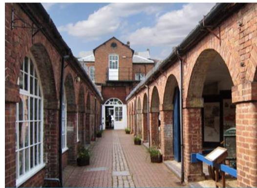
What does the future hold for our Town's gem? WFDC must come back to the Town

Your local Conservative Town Councillors were pleased when the District Council's Localism agenda eventually resulted in Borough House, the public toilets, and Riverside North Park being transferred to Bewdley Town Council.