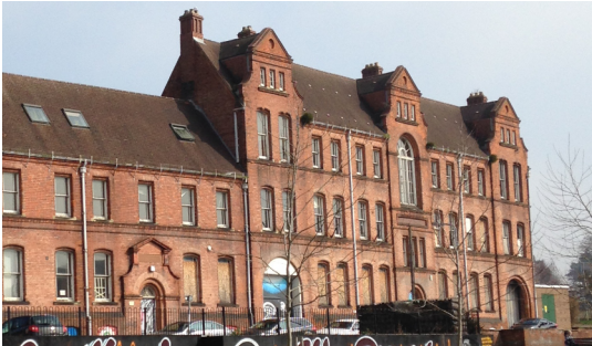
The Old Magistrates Courts to be redeveloped - funded by the Government’s Levelling Up Fund