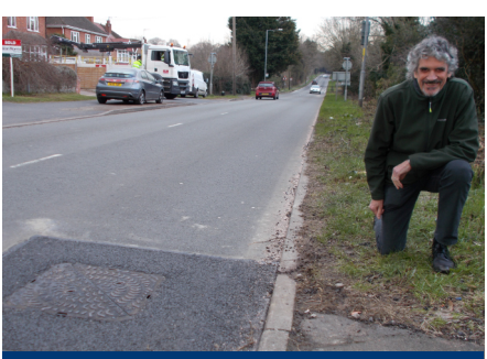
Good team work ensures that jobs are actioned quickly for residents