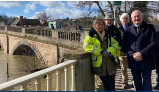
Rebecca Pow, Minister for Floods, visited Beales Corner in February with County Cllr Ian Hardiman and colleagues from Worcestershire County Council

The development for permanent flood defences at Beales Corner continues on schedule for completion by Autumn 2024. As previously reported the funding is ringfenced and drawings are currently being finalised prior to a further public consultation before the plans are due to be submitted to Wyre Forest District Council for planning pormission this summer