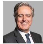
Mark Garnier Member of Parliament 01562 746771