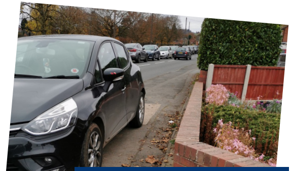
We will continue for more enforcement to tackle illegal parking