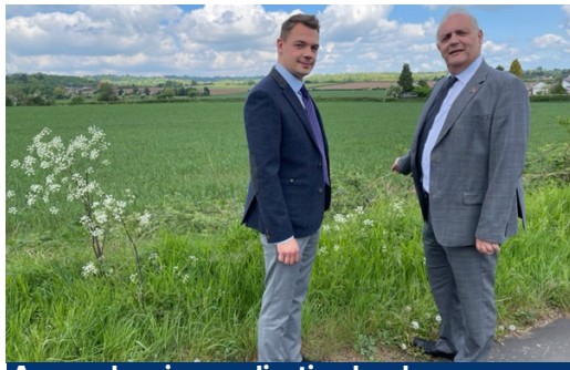
A new planning application has been submitted for Low Habberley