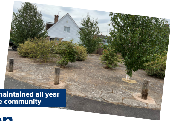
Ensuring our local area is maintained all year round restoring pride in the community