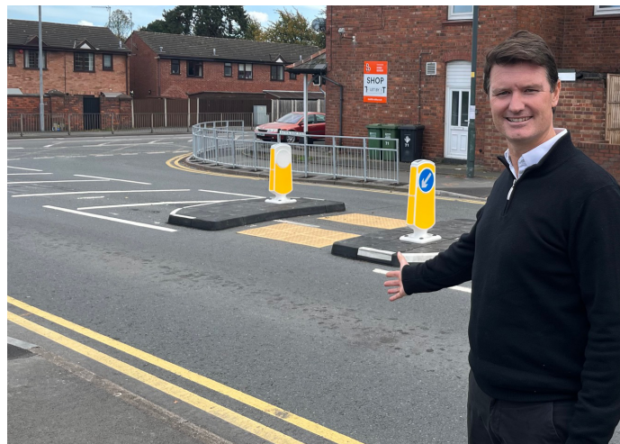
The new wider and safer pedestrian crossing is now installed on Stouport Road

Nathan said, "I am really happy to see the new safety barriers and central refuge crossing finally constructed. Its been a long process but well worth it as these changes have dramatically increased pedestrian safety and I know local residents are delighted with the work."