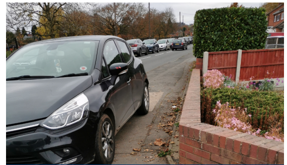
Police have now warned drivers and next time tickets will will be issued