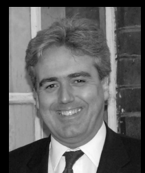
Mark Garnier MP