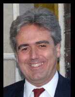
Mark Garnier MP