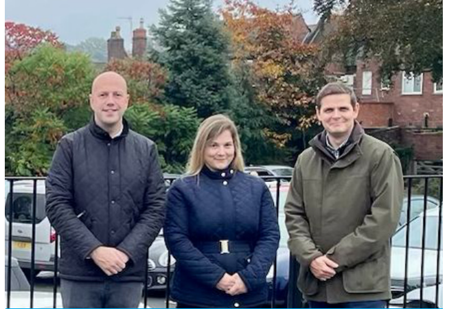
Return of one-hour free parking for Bewdley is a commitment by your local Conservative team, after the Independent controlled District Council removed it.